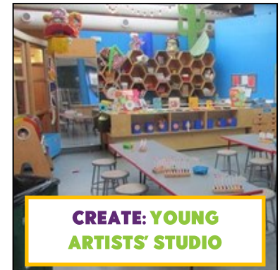
CREATE: YOUNG ARTISTS' STUDIO