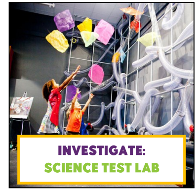
INVESTIGATE: SCIENCE TEST LAB