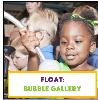
FLOAT: BUBBLE GALLERY

CMNC's exhibits and programming will promote open-ended exploration across different modalities and interests. Each experience is curated with children and their caregivers in mind. The exhibits will invite exploration and encourage playful, social interactions between children and their caregivers.