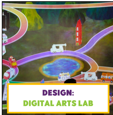
DESIGN: DIGITAL ARTS LAB