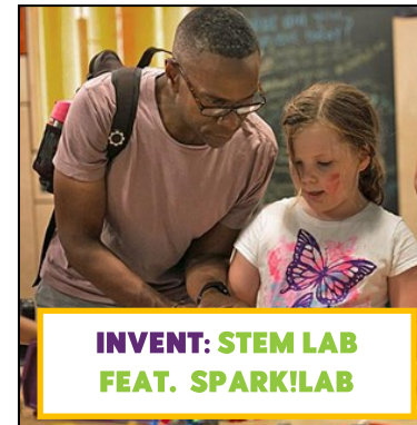
INVENT: STEM LAB FEAT. SPARK!LAB