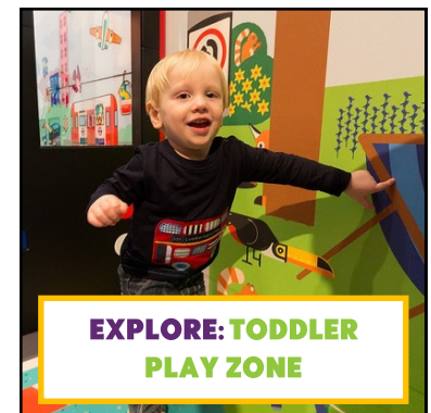
EXPLORE: TODDLER PLAY ZONE