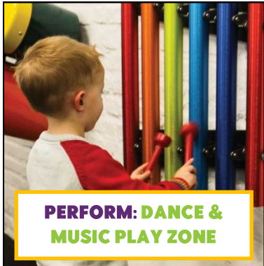
PERFORM: DANCE & MUSIC PLAY ZONE