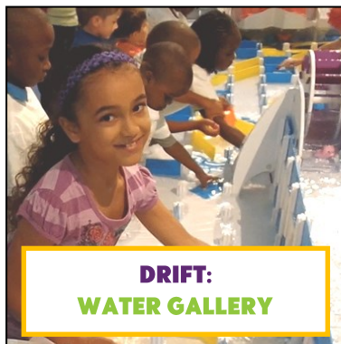
DRIFT: WATER GALLERY