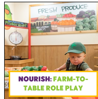
NOURISH: FARM-TO-TABLE ROLE PLAY