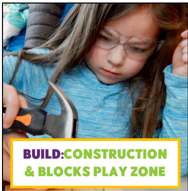
BUILD: CONSTRUCTION & BLOCKS PLAY ZONE